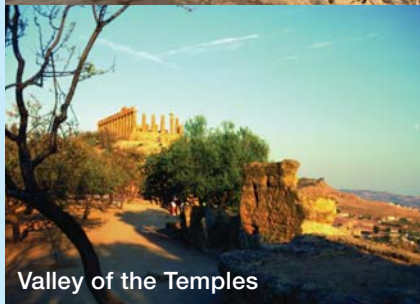
Valley of the Temples