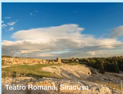
Teatro Romana, Siracusa